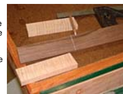
Fig. 1. I marked a reference line 5-1/2" away from the end of the wood so I could line up the top end of the handle. This prevents one side of the handle from being longer than the other.

**Available from Packard Woodworks; phone: 800-683-8876; website: www.packardwoodworks.com ; or from Craft Supplies USA; phone: 800-551-8876; website: http://www.woodturnerscatalog.com/ .