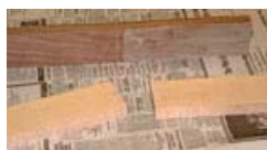
Fig. 2. Glue is applied to all surfaces that touch. Note how I stayed just slightly away from the reference line. I didn't want too much glue to squeeze out