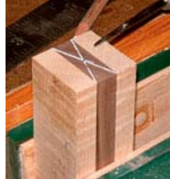
Fig.4. Find the center of the middle block on the handle side and carefully centerpunch it with a sharp awl. Do the same to the other end as well.