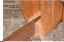
Fig.3. Any squeezed out glue between the junction of the maple and walnut must be removed with a damp cloth. Adjustable hand screws are a good choice for clamps.

from the end of the handle. It's hard to remove!