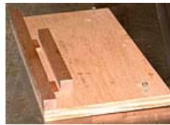
Fig.14. This is the jig I use to flex the body of the knife so the handle will be good and tight. If the blade is loose, it's worthless!

An oscillating spindle sander works best to sand the inside and outside curves. (However, a drum sander installed in a drill press could also be used.) But again, just as before, the blade portion must be elevated to do so. Draw a circle in the center of a piece of waste stock slightly larger than the 2" drum used. Cut it out on the bandsaw and use the double stick tape to attach the scrap to the table of the sander (see Fig. 11).