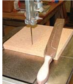
Fig.10. A small piece of scrap stock is used to elevate the knife to compensate for the thicker handle.