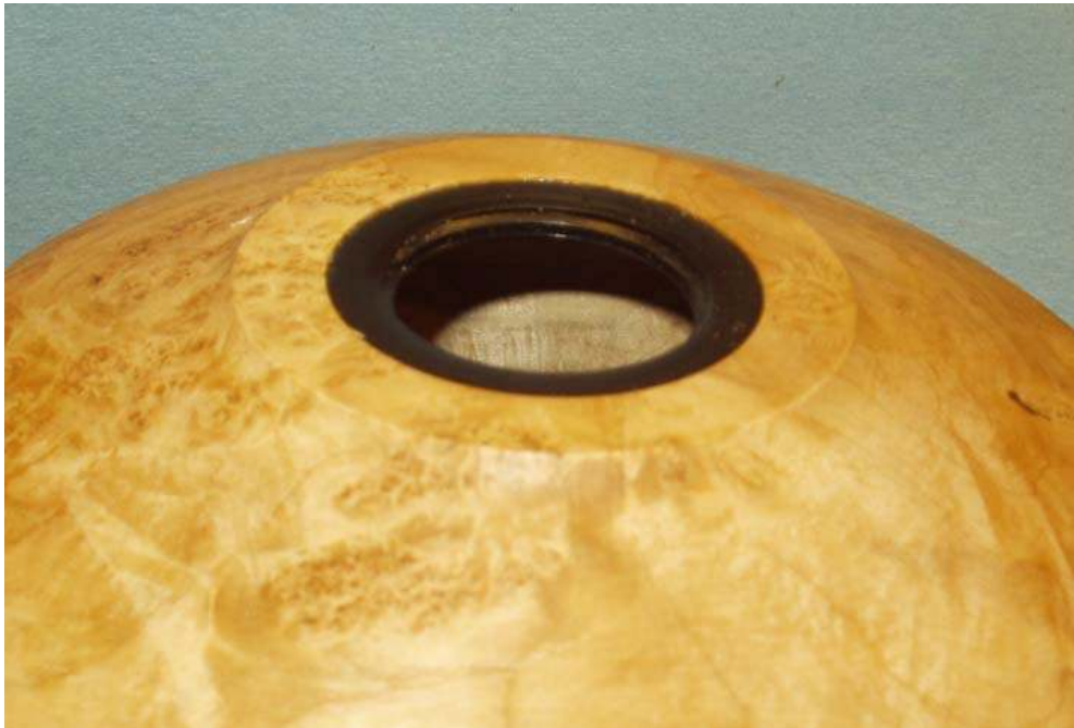
Here are the female threads glued into the neck of the urn.