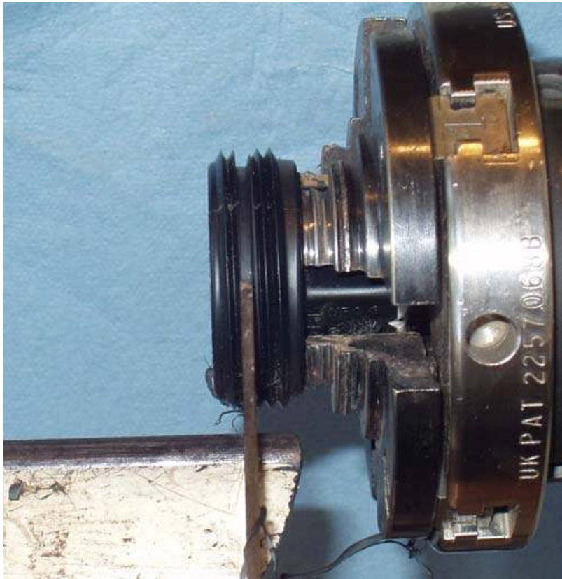
Part off about \frac{1}{4} " of the male threads.