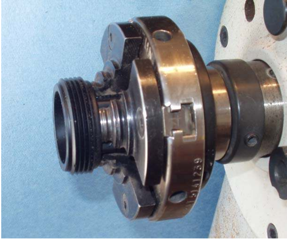
Grip the square end of the male part in a chuck.